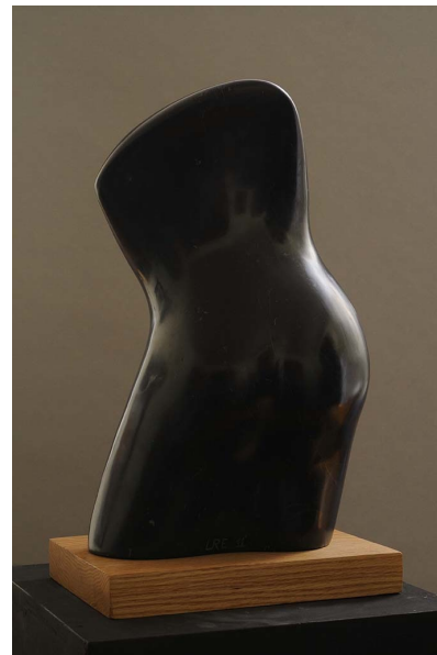
Lilian R. Engel, Tendu (2011), marble